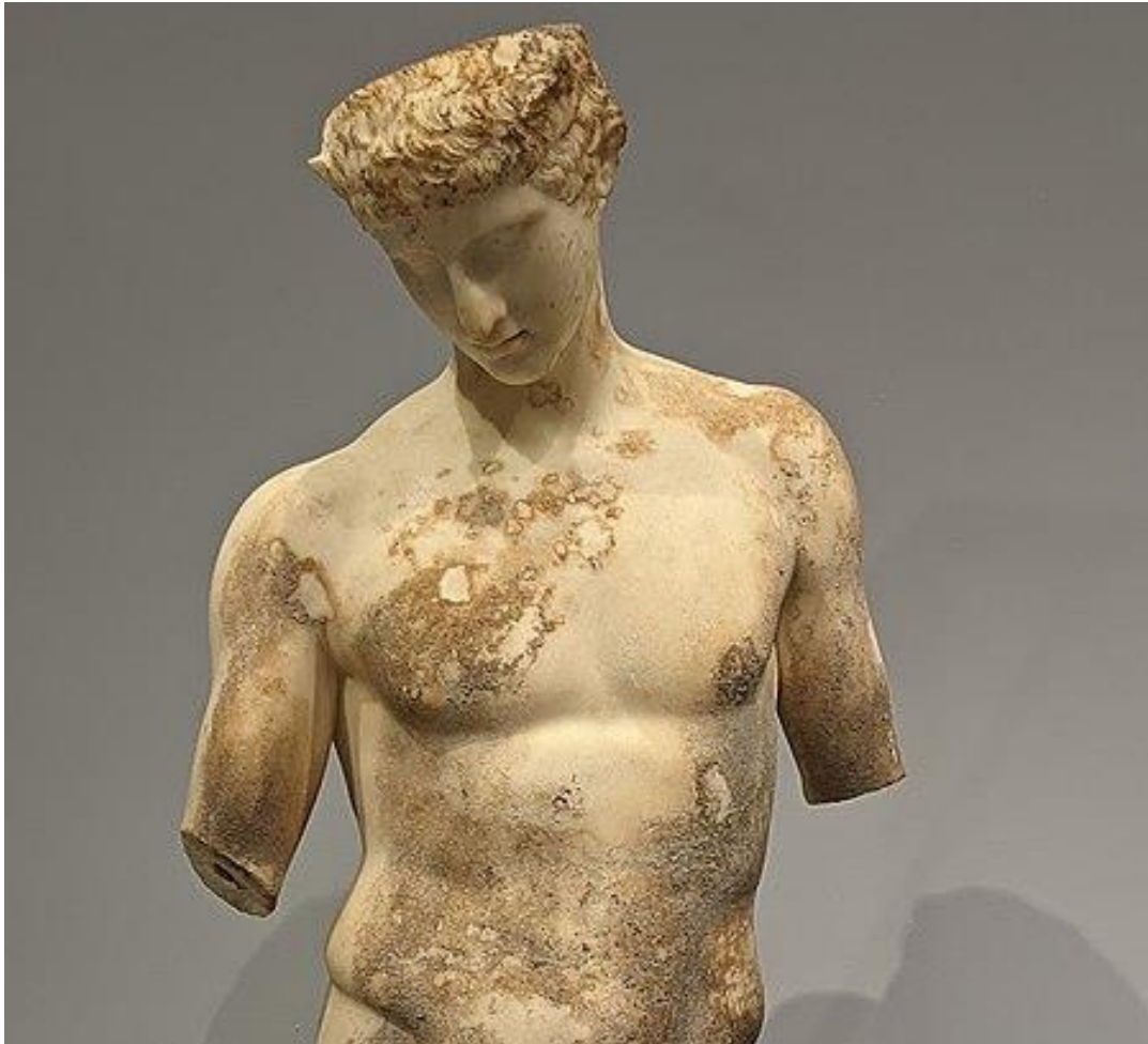
Mercury (ca. 30 – 50 CE). This sculpture is in the museum of Fine Arts, Boston, MA.

Like most representations of the god, this statue originally had wings on either side of the head. His arms may have held a caduceus and a sack of gold. Wings symbolize his penchant for flight and height, a caduceus for his role as herald and messenger, and gold for trade and commerce.