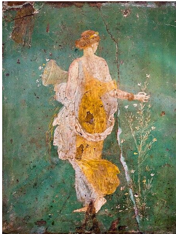
Roman Flora, an allegory of Spring

In the astrological arena, Mars entered this year retrograde, then opposed Pluto. Metaphorically he has strengthened his position internally. As Mars would say, "it's up to me and you".